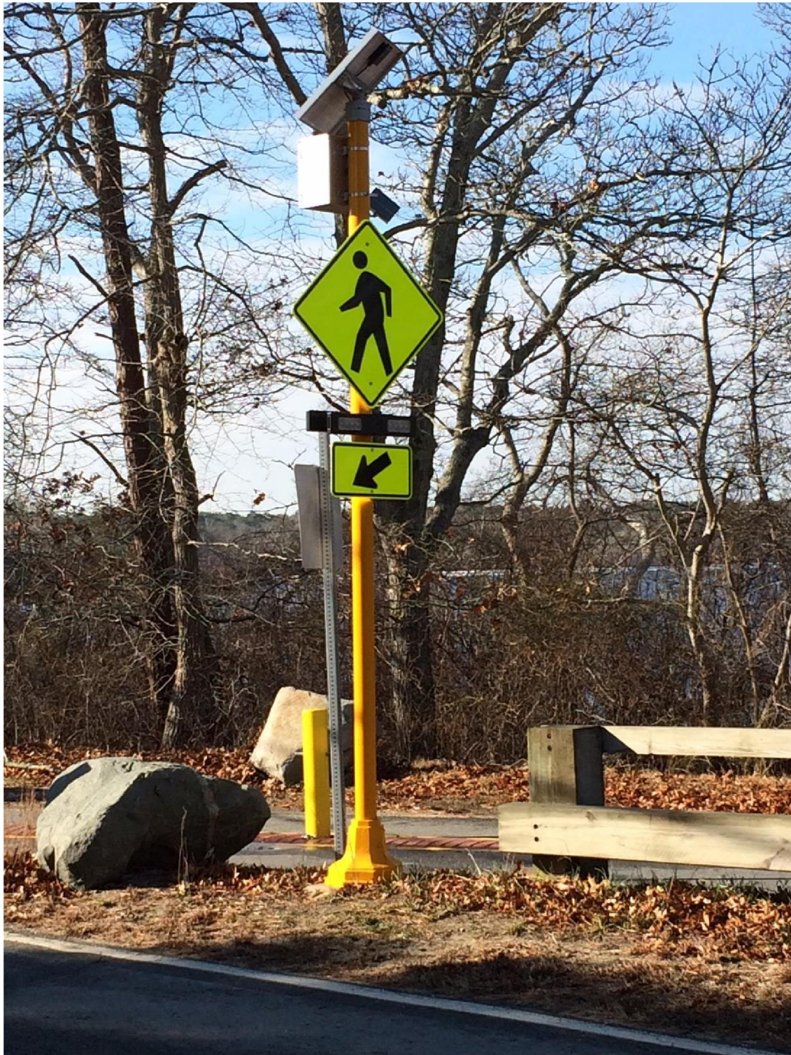
Attachment 1: Solar powered warning light at CCRT/Rt 124 in Harwich