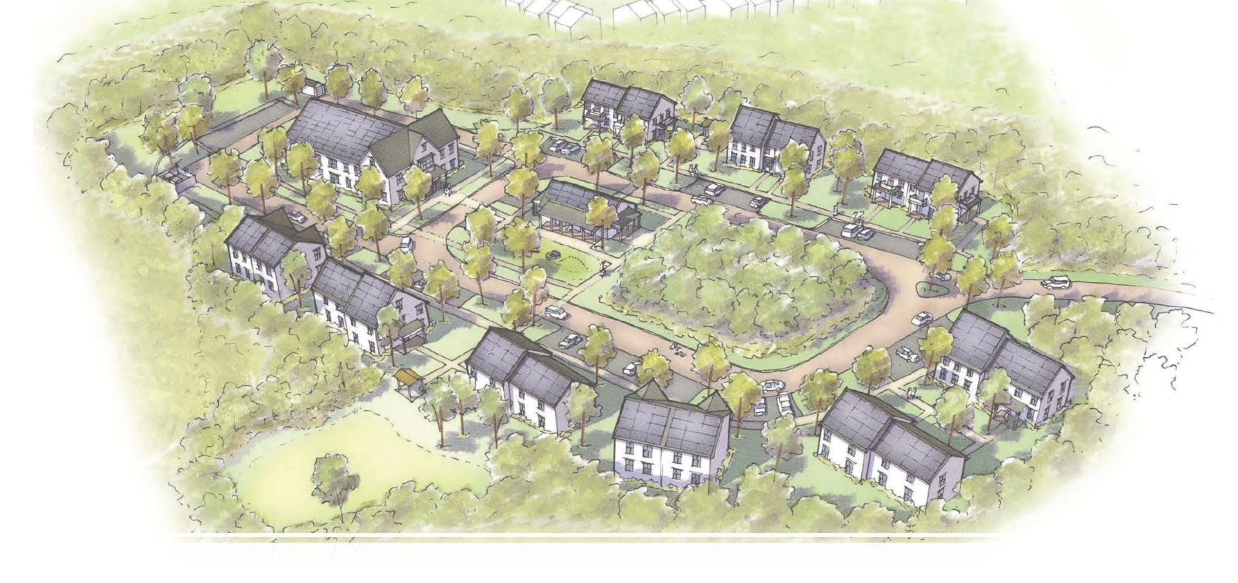
Local Preference Decision Point: 0 Millstone Road