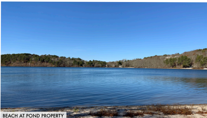
BEACH AT POND PROPERTY

For more details about the long-term planning process, information on Bay Property and Pond Property Planning Committee meetings and interim activities at both properties, please visit the project page, https://www.brewster-ma.gov/cape-cod-sea-camps-properties . To provide feedback to one of the committees, please email us at bppc@brewster-ma.gov (Bay property) or pppc@brewster-ma.gov (Pond property).