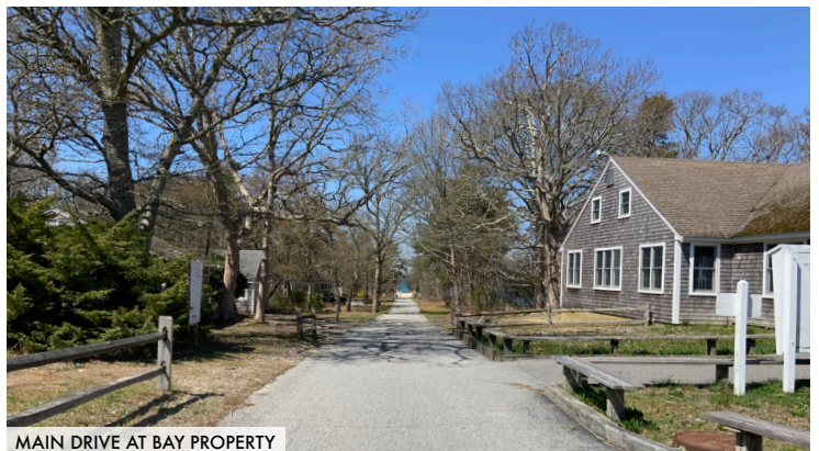
MAIN DRIVE AT BAY PROPERTY