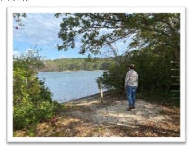
Photo 3. Kayak rack and smaller Long Pond beach adjacent to ACA cabins

With rights to use the above-mentioned area of the property (red circle in Photo 2) and the minimal investment of a small trail network, portable toilets, annual road grading, and limited parking access, Mass Audubon educators could use the Long Pond parcel for birding and other natural history walks as well as part of our multi day adult field school and naturalist certificate programs focused on natural history and conservation topics for residents and non-residents.