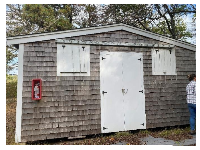
Photos 5. Photo 6. American Camp Association Accredited Cabins at Long Pond Parcel